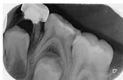
FIG. 4 A radiological failure with increase of the lesion after 1 year.

hand, pulpectomy on necrotic temporary teeth and filling with material containing iodoform showed great success (94 to 100%) [Sari and Okte 2008; Splieth 2011; Mendoza et al., 2010; Mortazavi and Mesbahi 2004; Shenkin 2012]. The difficulty and the risk in shaping the root canal are the reasons why many paedodontist opt for extraction of the tooth. For this reason, in the clinical protocol we propose, cleaning of the necrotic content of root canals is performed under irrigation [NaClO] with files N. 15 and 20 only, which present no risk. This way the necrotic debris can be removed from the canal while disinfecting. This approach represents an advantage with respect to the LSTR technique. [Pinky et al., 2011] and avoid petrification of the necrotic pulp