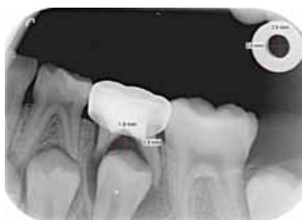
FIG. 1 Periapical x-ray showing vertical and horizontal measurements of the furcation bone loss on the second left lower primary molar.

Preoperative periapical radiographs of the selected teeth were performed using the Rhin system standard parallel technique. The same distance was applied between the film and the x-ray cone for all teeth. In the first 10 cases, a calibrated metallic ring (3 mm internal diameter, 7 mm