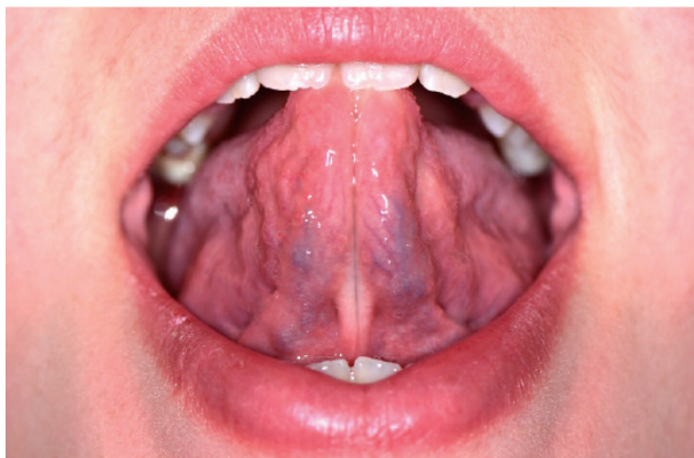
FIG. 1 The maximum opening of the mouth tongue spot

Italian law. Written consent was obtained from the parents of each toddler. The samples include fifteen patients, divided into test group A and control group B. The selection of patients in each group was based on the parents' choice to have the children undergo surgical/logopaedic treatment. The study was conducted for a period of six months. They are fourteen males and sixteen females, aged between 3 and 15 years. The mean age is 8.85 \pm 3.02 years. Patients with previous histories of frenectomies, orthodontic and maxilla-surgery treatments were excluded from this study. To evaluate palatal change, anatomical reference points are teeth 5.5, 6.5 and maxillary canines. Premature loss of this primary teeth is an exclusion criterion.