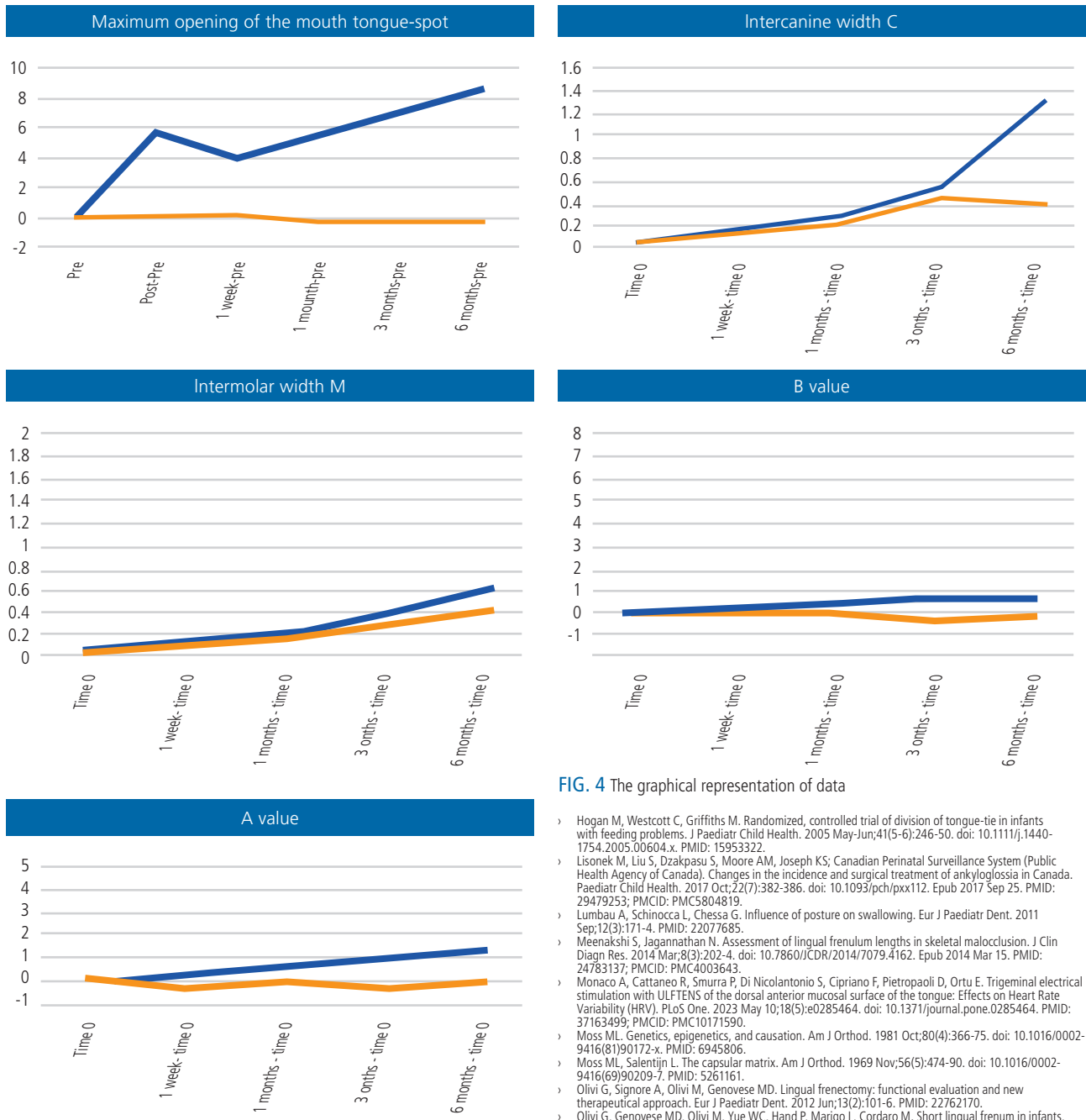
FIG. 4 The graphical representation of data