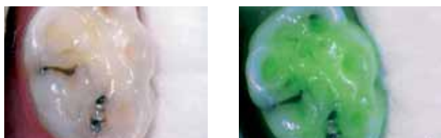
FIG. 4 Tooth 75: white light and fluorescence photo. Mean ICDAS: 4; Soprolife mean scores: dentine lesions; Diagnodent value: 28.

individually adjusted to the patient by applying the probe to a healthy side of a tooth and the occlusal surface of the tooth was scanned by moving the instrument in all directions, without applying pressure. The maximum observed value was recorded.