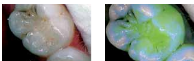
FIG. 3 Tooth 75: white light and fluorescence photo. Mean ICDAS 3; Soprolife mean score: enamel caries; Diagnodent value: 23.