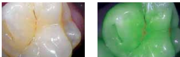
FIG. 1 Tooth 27: white light and fluorescence photo. Mean ICDAS: 1; Soprolife mean score: enamel caries; Diagnodent value: 7.